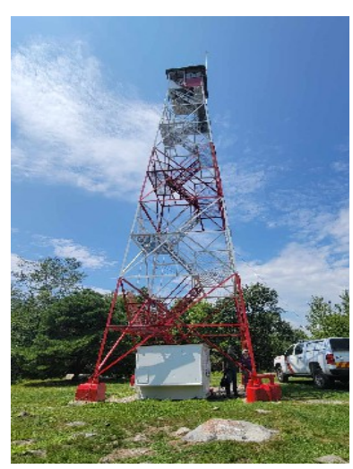
Catfish Fire Tower