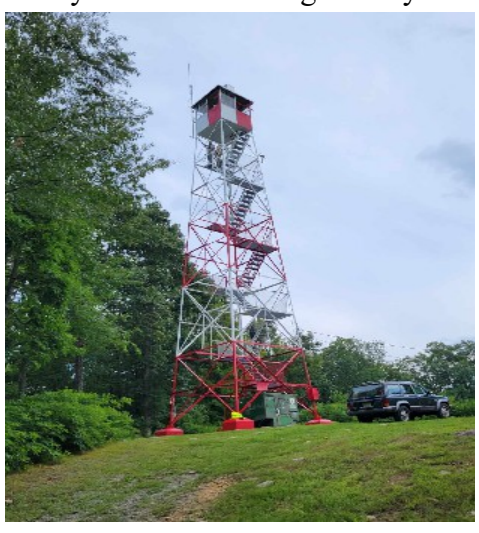
Budd Lake Fire Tower.