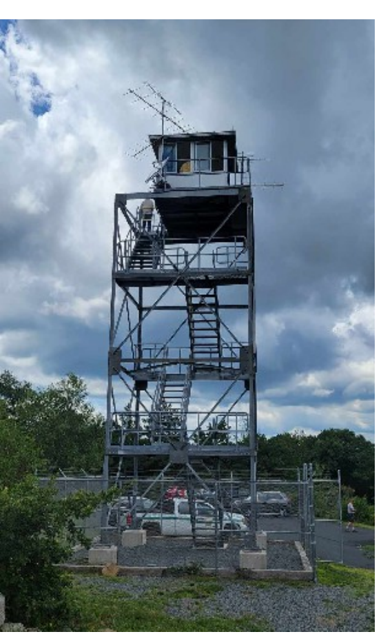
New Big Pocono Fire Tower

We hope you have enjoyed all of the news from the last month. We look forward to our 10<sup>th</sup> Annual Lighting Event in the next few weeks and thank all of our Illuminators for making this happen. Please check out website for updates on that event and other happenings in association with that event. Www.nysffla.org Just click on Light Up the Night.