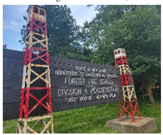
Headquarters for NJ forest fire service in Andover