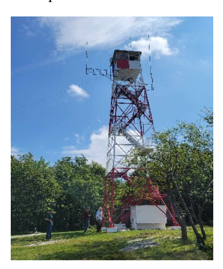
Culvers Fire Tower